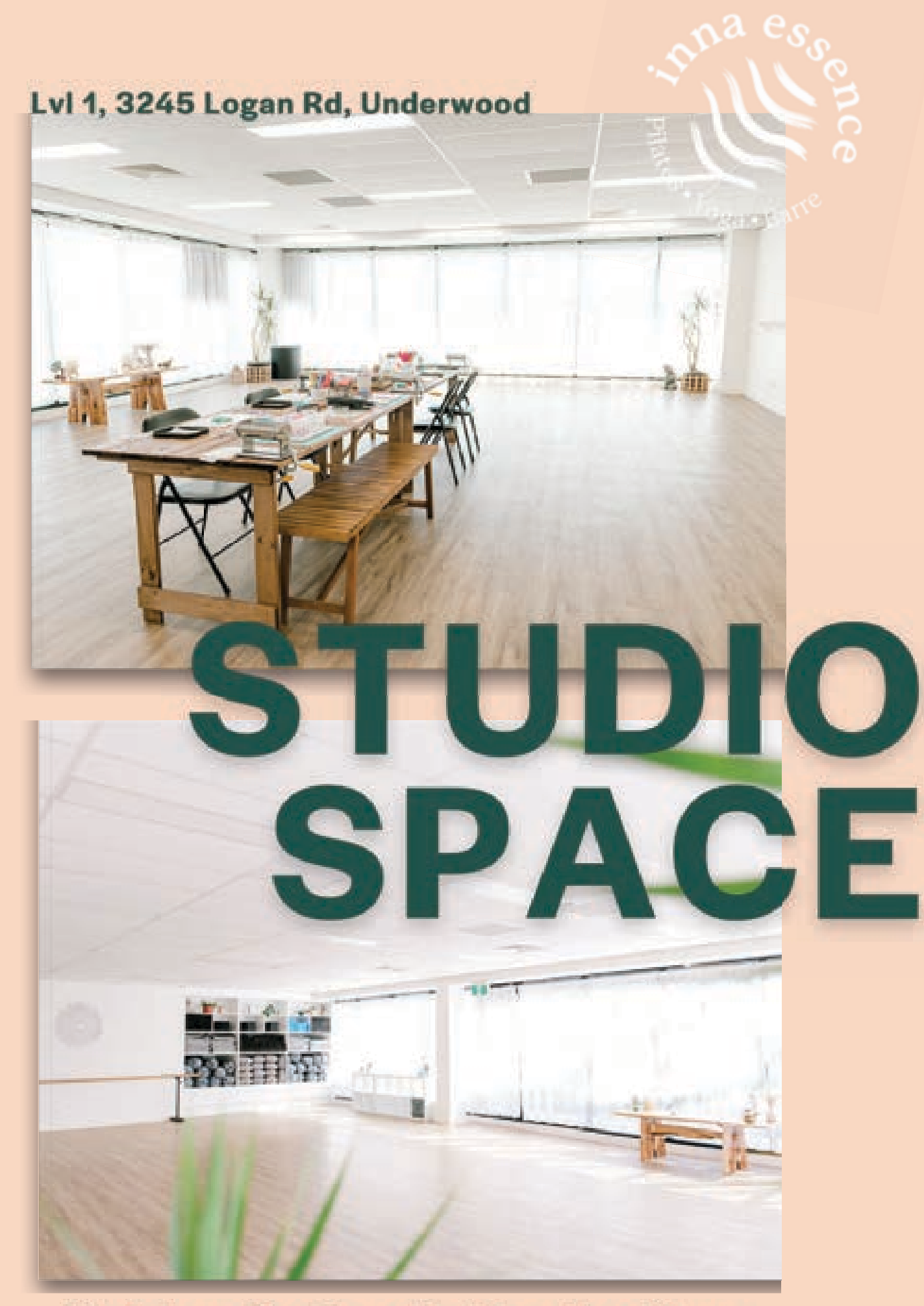
Workshop + Creative + Training + Event Space